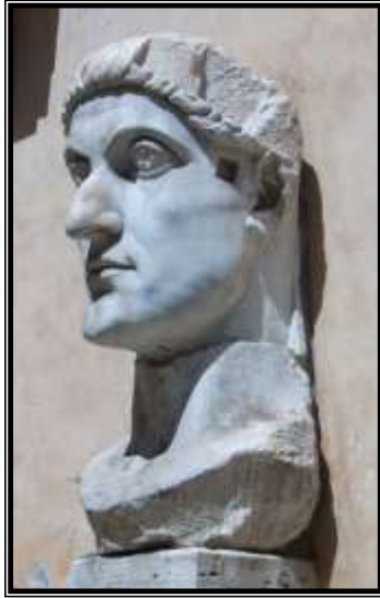
Statue of Constantine I, 313–324 AD

Not only was toleration of the Christian religion declared during this time, it was written that all property and places of worship were to be restored to those professing Christianity. When considering the time frame of Christian persecution during this era of the Church, we see that Christ's prophecy of ten years of tribulation occurred from 303 to 313 A.D.