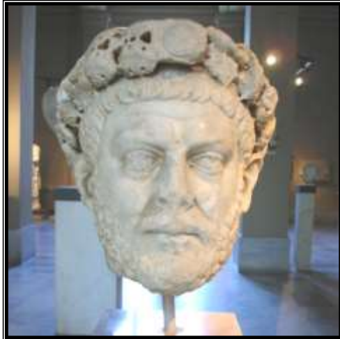
Statue of Emperor Diocletianus, 284-305 AD

Next day an edict was published, depriving the Christians of all honours and dignities; ordaining also that, without any distinction of rank or degree, they should be subjected to tortures, and that every suit at law should be received against them; while, on the other hand, they were debarred from being plaintiffs in questions of wrong, adultery, or theft; and, finally, that they should neither be capable of freedom, nor have right of suffrage ( Ante-Nicene Fathers ; Fathers of the Third and Fourth Centuries, Chap. XIII).