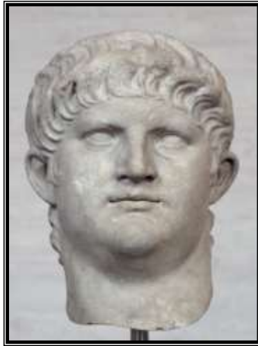
Statuary of Nero 64 AD

faith, the Second Coming being the supreme event which the elect were hourly expecting; and so great a disaster could not have been thought to be anything but the beginning of this tremendous advent. They thought Jesus was coming! The heavens would open now at any moment, and they would see Him riding upon the fiery clouds (pp. 295-296).