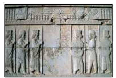
Relief of Median and Persian soldiers marching together

The second beast Daniel saw was the Medo-Persian Empire symbolized by a bear with three ribs in its mouth (Dan. 7:5). The ribs represent Babylon, Lydia, and Egypt which are three significant nations that this empire conquered. Medo-Persia remained the prominent government for more than 200 years ( The Story of Civilization , Vol. I, Ch. XIII). It was during this time that King Cyrus issued an edict to free the Jews taken captive by Nebuchadnezzar (Ezra 1). Later, King Artaxerxes, also known as Ahasuerus, was noted for marrying Esther and dealing with Persia's administration of Judah (Est. 2-10).